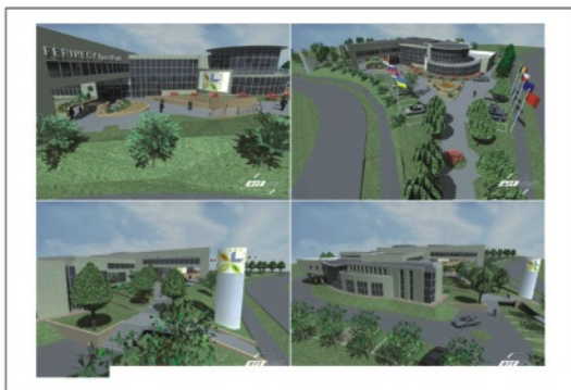
Ferihegy industrial park, railway siding