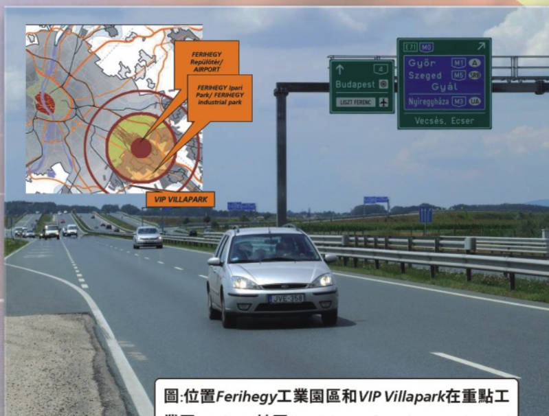
圖:位置Ferihegy工業園區和VIP Villapark在重點工業區Ferihegy地區/ Location of Ferihegy Industrial Park and VIP Villapark in the priority industrial zone of Ferihegy region